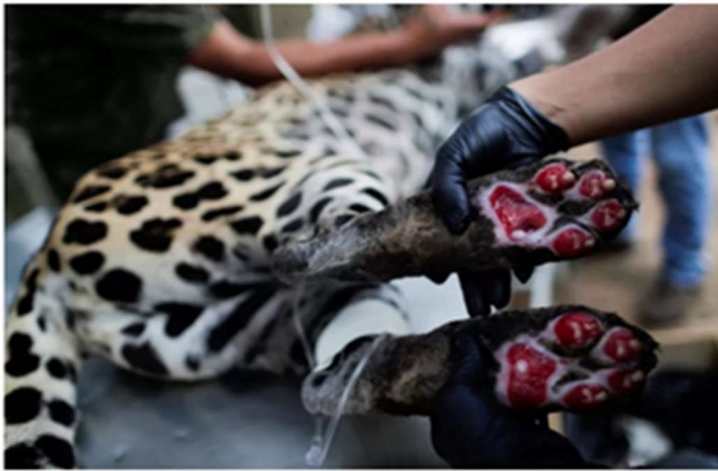
Image of a jaguar with severe burns on its paws, released by G1, without a warning to the reader.

Cuidador mostra queimaduras nas patas de uma onça-pintada adulta chamada Amanaci sofrida após um incêndio no Pantanal, enquanto o animal passava por tratamento com células-tronco, na ONG Instituto Nex, em Corumbá de Goiás