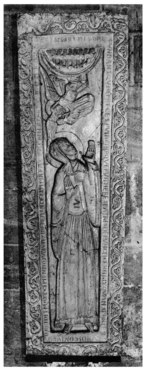
Fig. 18. Reinhildis Holy person, tomb slab, c. 1180, St. Calixtus Church, Reisenbeck, Nordrhein-Westfalen, Germany. After Panofsky 1924, vol. II, Taf. 17.