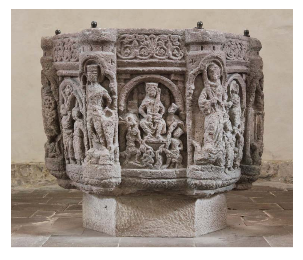
A LEGACY OF RESISTANCE: THE CASE OF THE FRECKENHORST BAPTISMAL FONT

Fig. 11. Lippoldsberg baptismal font, mid-13th century, Parish Church of SS. George and Mary, Lippoldsberg, Westphalia, Germany.