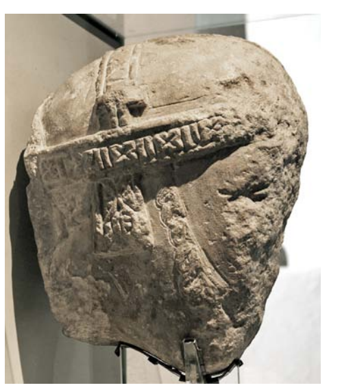
Fig. 14. Imperial Head, c. 1129, Collegiate Church of St. Boniface, Warendorf, Germany.

The reference to comparative works, ideally within the same region and medium, served to legitimize and validate an early twelfth-century date. However, the quest for comparative, early twelfth century works within Westphalia to support an early twelfth century date for the Freckenhorst font failed. In fact, no comparable sculptural works were found even within the broader scope of northern Germany. To compensate for this absence, a range of metal and ivory works as well as manuscripts were sought. In 1924 Panofsky argued that Belgian and Cologne ivories of the eleventh century were influential, although later Karl Noehles in 1953 would dispute this influence.<sup>92</sup> Dehio's idea that a metal worker had carved the baptismal font due to the high degree of skilled workmanship, was an idea that was later reiterated by Pudelko in 1932.93 The fleur-de-lis motif and the band with the inscription separating the two registers on the font were compared to features found on regional metal works and formed part of the hypothesis supported by Dehio in 1919 and Panofsky in 1924.94 The fleurde-lis motif on the band around the basin was compared with similar motifs on met-