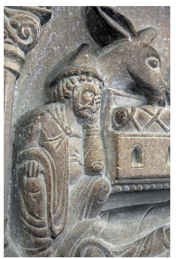
Fig. 22. Nativity scene with Joseph wearing a Judenhut, Freckenhorst baptismal font, late 12th century at the earliest, Collegiate Church of St. Boniface, Warendorf, Germany.

Jews is found primarily on works dated to the thirteenth century. For example, the Israelites Crossing the Red Sea on the Hildesheim font (c. 1225–1226) wear the Juden hut (fig. 23). In addition, the thirteenth century font at Stockum depicts Joseph in the Nativity scene wearing the Judenhut and it appears on those persecuting Christ in the Crucifixion scenes on the Bochum (Cofbuokheim) font, c. 1200; Nicodemus wears the Judenhut in the scene with Christ