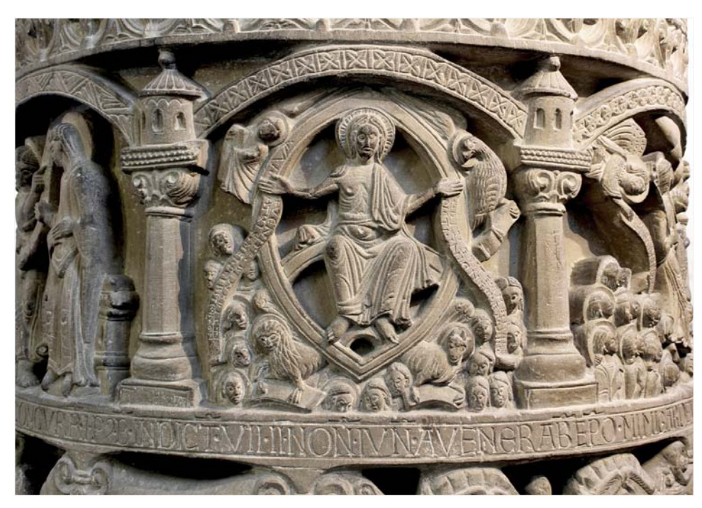
Fig. 4. Christ in Majesty, Freckenhorst baptismal font, late 12th century at the earliest to early 13th century, Collegiate Church of St. Boniface, Warendorf, Germany.

tions over the centuries. There are numerous medieval baptismal fonts with inscriptions that were later additions, reflecting a different date than the making of the vessel, a trend that escalated during the Reformation. In 1903 Stephan Beissel (1841– 1915), the German Jesuit and art historian, made an important point. He adamant ly wrote that the consecration date of St. Boniface was not the same date as the origin of the Freckenhorst baptismal font, and cited comparable thirteenth-century works, such as other Westphalian cylindrical fonts.<sup>32</sup> However, the disparity between