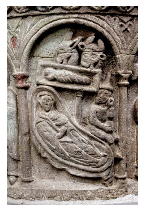
Fig. 21. Nativity scene, Stockum baptismal font, mid-to-late 13th century, St. Pankratius Church, Sundern-Stockum, Nordrhein-Westfalen, Germany.

The representation of Christ in Majesty on the Freckenhorst font, is a well-known motif from earlier periods. However, it is not until the mid-to-late twelfth century when variations of Christ in Judgement or Majesty begin to ornament northern stone baptismal fonts. The motif is known on the German Romanesque fonts at Assel, St. Ulrich im Schwarzwald, Gernrode, Lippoldsberg, Stockum and Würzburg. Farther afield, there are numerous representations of Christ in Majesty or Christ in Judgement on fonts located in England,