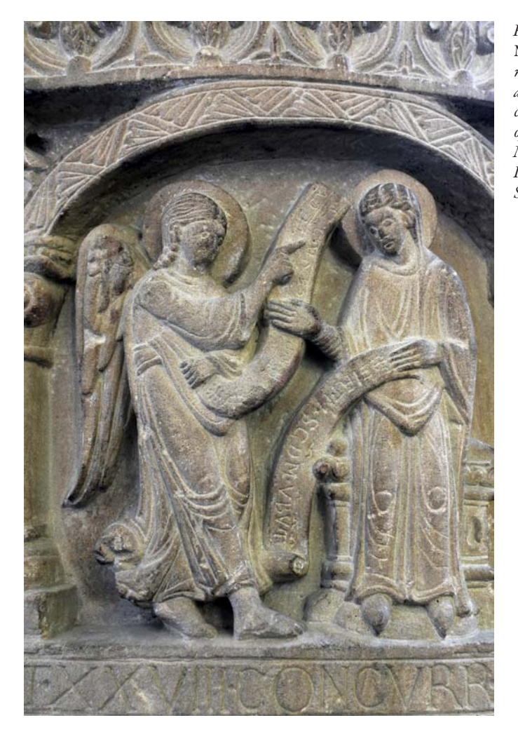
Fig. 2. Annunciation to Mary, Freckenhorst baptismal font, late 12th century at the earliest to early 13th century, Collegiate Church of St. Boniface, Warendorf, Münster, Germany.

iconography and in comparison with other works dated to before the middle of the twelfth century. In terms of medieval fonts, similar sculptural works are found in the late twelfth-and-thirteenth centuries, but not in the first half of the twelfth century – context matters. The on-going date debate and the continued reluctance to affirm a