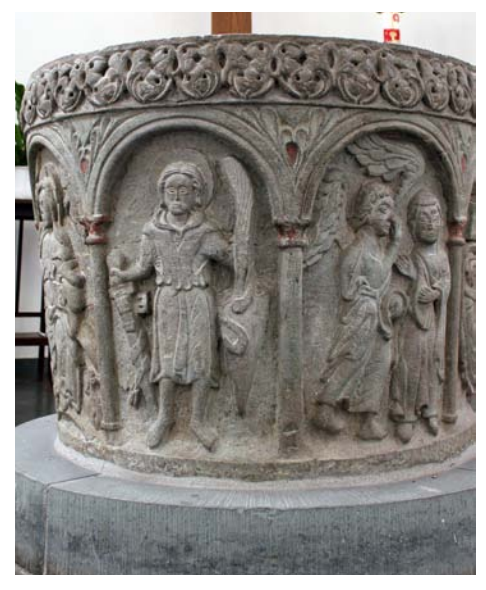
Fig. 20. Stockum baptismal font, mid-to-late 13th century, St. Pankratius Church, Sundern-Stockum, Nordrhein-Westfalen, Germany. Photo BSI.

on the tub-shaped, thirteenth-century baptismal font at Stockum (fig. 20), only 40 kilometers from Freckenhorst, depicts similar topics in the narrative cycle as seen on the Freckenhorst font. Both fonts depict the Annunciation, Nativity (fig. 21) and the Baptism of Christ. The Ascension of Christ and the Harrowing of Hell on the Freckenhorst font are replaced by a representation of the Adoration of the Magi and St. Pancratius on the Stockum font. Each scene on the Stockum font is framed by an arcade with a palmette border around the rim. Both the Stockum and Freckenhorst fonts were part of the northern trend in making cylindrical fonts with Christological narrative cycles.