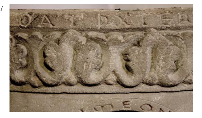
Fig. 8. Border, Vellern baptismal font, early 13th century, Parish Church of St. Pankratius, Beckum-Vellern, Nordrhein-Westfalen, Germany.

The Freckenhorst baptismal font has two pictorial registers separated by a narrow band that has the incised inscription. The upper register depicts seven scenes from the three seasons of Advent, Christmas and Easter that celebrate the life of Christ on earth and the victory of the Christian faith. The narrative reads chronologically from the right to left: the Annunciation, Christ in Majesty, Baptism of Christ, the Crucifixion, the Harrowing of Hell, the Ascension and the Nativity of Christ. The lower register has the bodies of four lions, three beastly heads and one male. The male flanked by two lions has been identified as the Old Testament