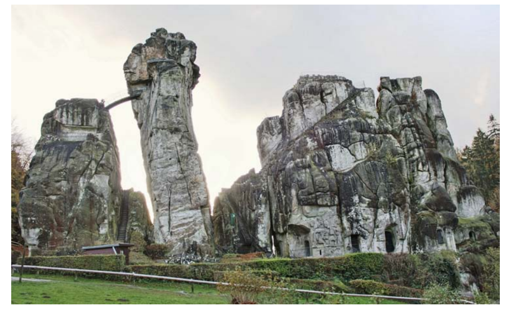
Fig. 12. View of Externsteine site, Horn-Bad Meinberg, Westphalia, Germany.

previous context of carving monumental works for the Freckenhorst font. The Externsteine is the name for an ancient openair site with a group of dramatic sandstone formations in the Teutoburg Forest next to the Oberer Teich lake and Weimbecke river (fig. 12). In the medieval period the site was provided with a chapel, which had an altar with the inscribed date of 1115-1119. On the exterior side of the rock formation is the monumental relief of the Descent of Christ from the Cross. Dehio's assertion of the 1115 date for this relief was based on the inscription on the altar in the chapel, a view that was widely held at that time. Today, however, this monumental sculpture has been re-dated to c. 1190 at the earliest or