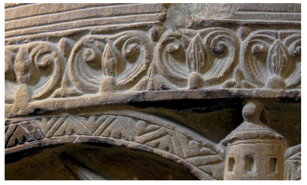
Fig. 7. Border on Freckenhorst baptismal font, late 12th century at the earliest to early 13th century, Collegiate Church of St. Boniface, Warendorf, Münster, Germany.

and around the border of the later tomb slab for Abbess Beatrice I, known also as Beatrice of Franconia (1037–13 July 1061) of Quedlinburg Abbey (fig. 19).<sup>75</sup> A variety of similar borders to the Freckenhorst font are illustrated in the Gospel of Henry the Lion, c. 1188 (Evangeliar Heinrichs d. Löwen, Cod. Guelf. 105 Noviss. 2°), a manuscript from the Helmarshausen Benedictine abbey, which re-emerged in 1983 after having been lost for several decades (now in München, Bayerische Staatsbibliothek, Clm 30055).<sup>76</sup> Folios 10v, 11r, 12r, and 16r are a few examples in this manuscript that have variations of the same palmette motif.<sup>77</sup> Likewise, the same crossed-square carved on the arch over the font's Christ in Majesty scene is embellished and frames