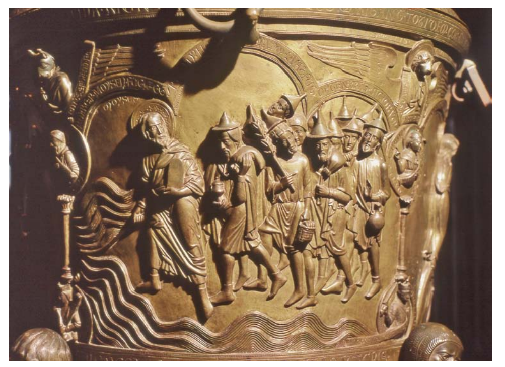
Fig. 23. Moses leading the Israelites across the Red Sea, Hildesheim baptismal font, c. 1225–1226, St. Maria Cathedral, Hildesheim, Germany.

ly thirteenth-century fonts by the Danish medieval "Knislinge workshop", which depicted Joseph wearing the Judenhut on the fonts at Knislinge, Kviinge, Norra Lundby, Okome, Oppmanna and Södra Mellby, which tend to be dated to c. 1200 or the early decades of the thirteenth century.