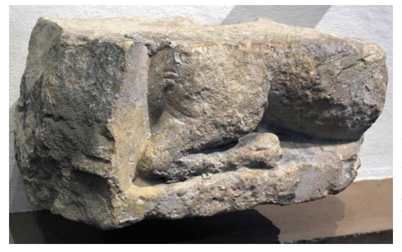
Fig. 16. Lion fragment, 13th century, Freckenhorst Stiftskammer, Collegiate Church of St. Boniface, Warendorf, Germany.

questioning the political debates or ideological contexts in which the 1129 date had been accepted. With each additional publication by renowned scholars that supported an early twelfth century date, it became increasingly difficult to argue for a later, more appropriate date for the Freckenhorst font. Nevertheless, from the beginning, counter arguments were introduced that questioned the pivotal role that the font acquired within the scholarship. In 1834 Fredrick Wiggert, on the basis of the inscription, dated the Merseburg font to the last decade of the twelfth century or first decade of the thirteenth century.<sup>112</sup> In 1910 Max Creutz, instead of seeking earlier sources, once again drew readers' attention to the similarities between the lower lion motif on the Merseburg and Freckenhorst fonts. In 1924 the Merseburg font was dated to 1170–1190 by Beenken, who acknowledged that it was a later work than