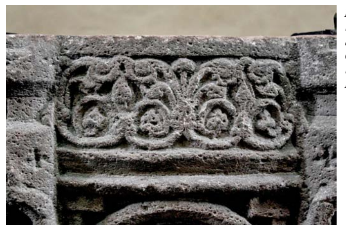
Fig. 10. Border on Lippoldsberg baptismal font, mid-13th century, Parish Church of SS. George and Mary, Lippoldsberg, Westphalia, Germany. Photo BSI.

Fig. 11. Lippoldsberg baptismal font, mid-13th century, Parish Church of SS. George and Mary, Lippoldsberg, Westphalia, Germany. Photo BSI.