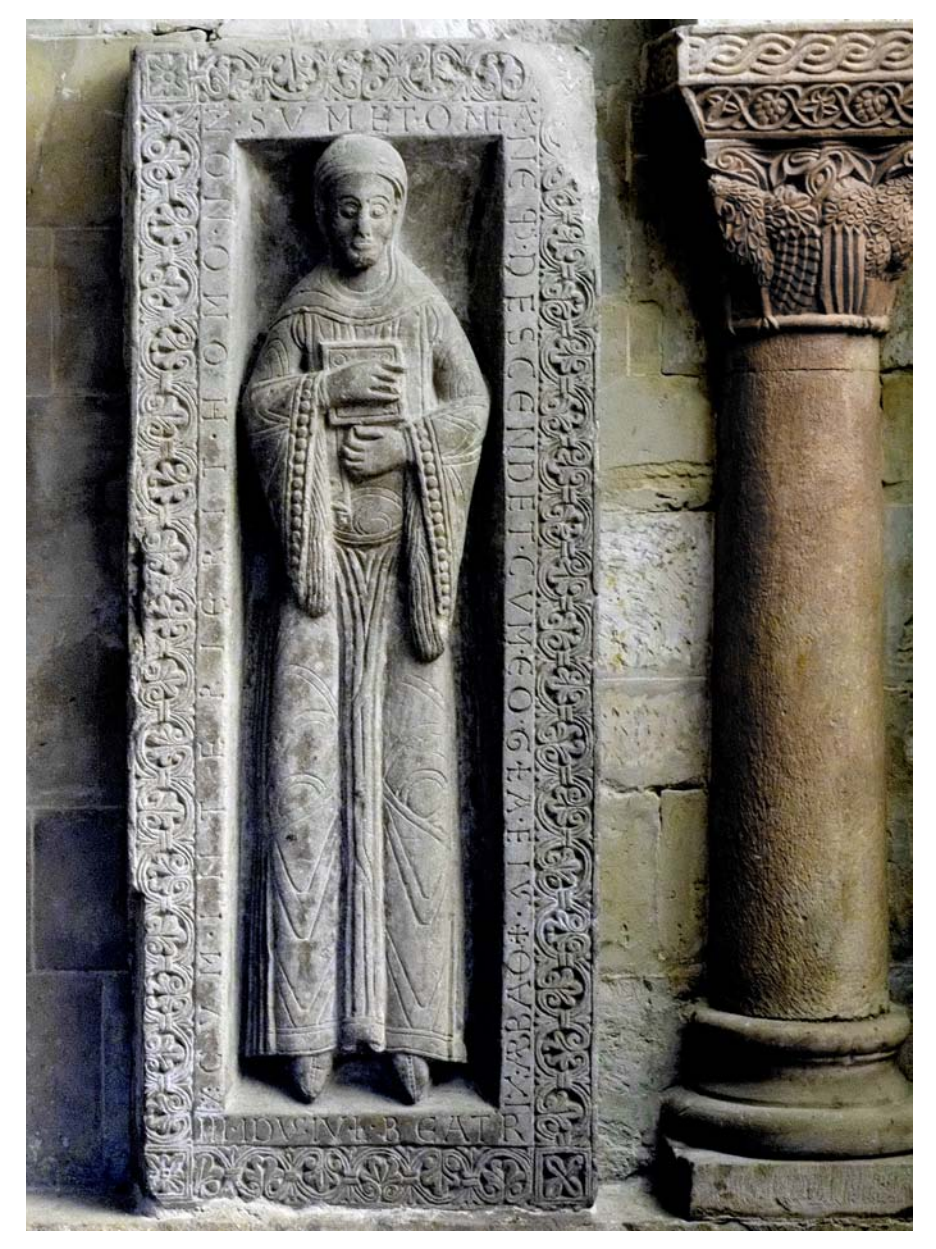
Fig. 19. Abbess Beatrice I, tomb slab, late 12th century, Quedlinburg Abbey, Saxony-Anholt, Germany.