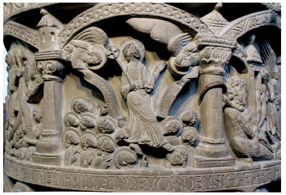
Fig. 3. Ascension of Christ, Freckenhorst baptismal font, late 12th century at the earliest to early 13th century, Collegiate Church of St. Boniface, Warendorf, Münster, Germany.

scription records the consecration date of St. Boniface by Bishop Egbert in 1129: