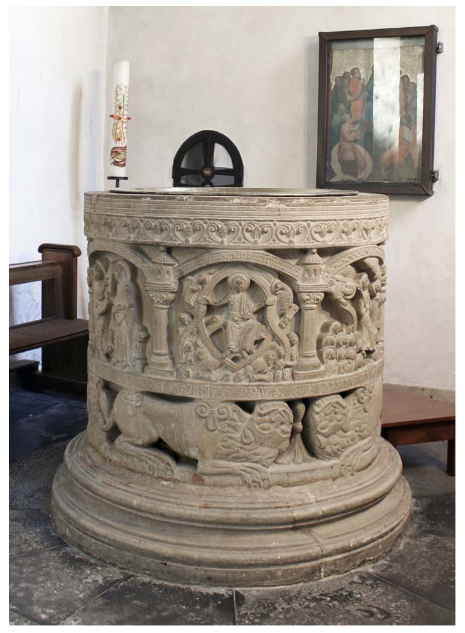
Fig. 1. Freckenhorst baptismal font, late 12th century at the earliest to early 13th century, Collegiate Church of St. Boniface, Warendorf, Münster, Germany.