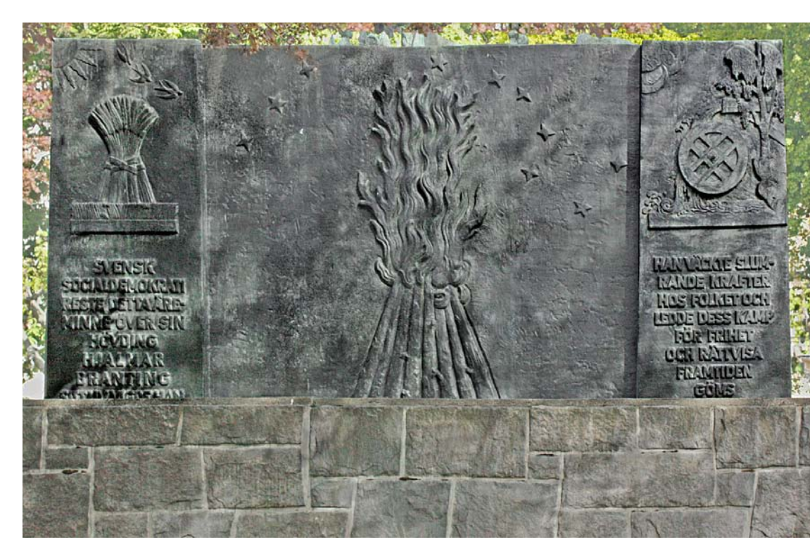
Fig. 10. The rear side of the Hjalmar Branting monument, Stockholm. Translation of the full inscription, to the left: "Swedish social democracy erected this monument in honour of its great leader [hövding] Hjalmar Branting. He dedicated his life to the workers of Sweden." To the right: "He aroused the dormant strengths of the people and led its struggle for freedom and justice. In his work the future lies hidden."

As mentioned above, in the monument, Branting stands on a small protruding elevation. This platform and the iconographic elements on it, around Branting's lower legs, can be interpreted as significative of the status of the leader in the Swedish context of folkhem and social democracy. To the immediate left of Branting's feet, a pine sapling appears to be growing, and to the right, a small fairy clings dreamingly to a tuft of grass and flowers.<sup>53</sup> This symbolism is quite unrelated to that of socialism and labour union struggle. It instead relates to folkloristic notions of great importance for Swedish national romanticism, in its dedication to rural traditions and the mysticism of nature. In their function as reminders of national identity and the actual soil and blood of the nation, the vegetative elements and the fairy are also easily associated with the concept of a "home of the people". They connect Branting and his followers on the "ground level" and make the leader appear as only temporarily risen above the people.