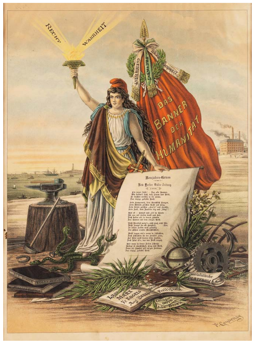
Fig. 2. "F. Cambensy" (pseudonym?), Neujahrs-Gruss (New Year's Greeting), printed for inclusion in New Yorker Volks-Zeitung, Christmas Sunday edition 1888. Chromolitograph, 48.3 x 68.6 cm, private collection (offered for sale at Heritage Auctions, November 2014).

The space around Liberty is filled with various references to different professions and to industrious work and studies. Seafaring and heavy industry are represented in the background. To Liberty's left we see a blacksmith's anvil and hammers, to the right oak leaves and various objects of agriculture, forestry, sea-