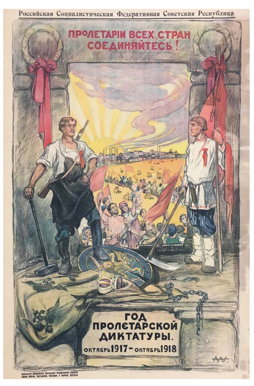
Fig. 7. Alexander Apsit (Aleksandrs Apsītis, 1880–1944), Год Пролетарской Диктатуры, октябры 1917– октябры 1918. (First anniversary of the dictatorship of the proletariat, October 1917– October 1918), poster.

Victoria E. Bonnell considers Apsit's poster to be "the first major statement of a new image in Bolshevik iconography".<sup>43</sup> As she proceeds to demonstrate,