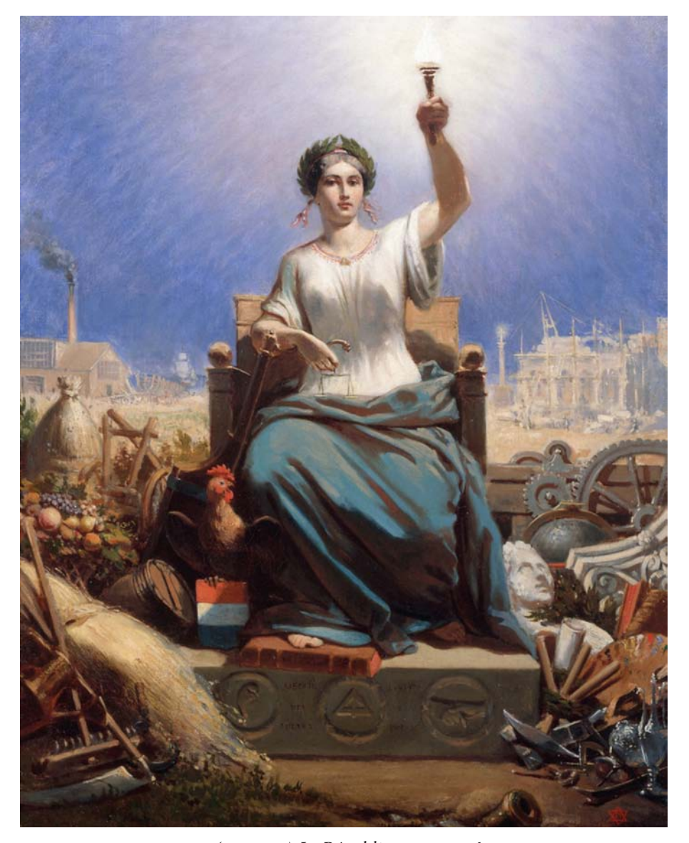
Fig. 1. Ange-Louis Janet (1811–1872), La République, 1848. Oil on canvas, 72.5 x 59 cm. Musée Carnavalet, Paris, acquisition number P188 (acquired in 1888).