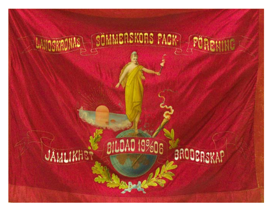
Fig. 4. Banner of the labour union of seamstresses in Landskrona, founded in 1906. Collection of the Archive of the Labour Movement in Landskrona, Sweden.

Prejudiced opinions about the masculine or "patriarchal" character of labour unionism are countered by such examples as the local club of seamstresses in Landskrona, Sweden. It was founded on 9 September 1906 and immediately applied for membership in the nationwide Women's Labour Union ( Kvinnor nas fackförbund ).<sup>29</sup> The club's banner was commissioned from Viktor Lindblad's decoration firm in Örebro and was inaugurated in 1907 (fig. 4).<sup>30</sup> Its iconography is typical of the comparatively traditional output of Lindblad's firm