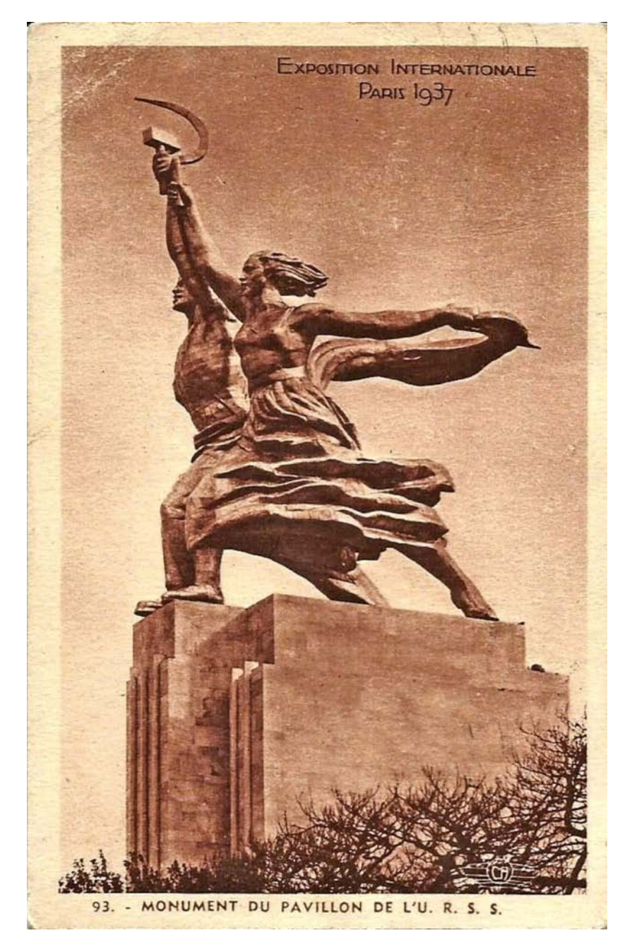
Fig. 8. Postcard for the 1937 world exposition in Paris, showing the Soviet pavilion designed by Boris M. Iofan (1891–1976). Top sculpture by Vera Mukhina (1889–1953): Рабо́чий и Колхо́зница (Industrial worker and kolkhos woman), 1937. Stainless steel, height 24.5 m. Now at the VDNKh (Exhibition Center of National Achievements), Moscow.

This conception received its ultimate monumental formula in Industrial Worker and Kolkhoz Woman, the 24.5 m. tall sculpture in stainless steel, designed for the 1937 Exposition Internationale in Paris by Vera Mukhina (1889-1953). The union of man and woman, industry and agriculture, party and state are here complete (fig. 8). The attributes of industry and agriculture, the hammer and the sickle, are identical to those of the party and the state. The man and the woman, equally muscular, join their attributes and stride forward in a diagonal movement of unanimous alliance. They are not meant to be interpreted as portraits or realistic representations in the sense favoured by those socially conscious contemporaries of Walter Runeberg, such as Jules Dalou (1838–1902). Instead Mukhina adheres closely to the new doctrines of socialist realism and the principle referred to in Russian as tipazh . As Bonnell explains, tipazh was to be regarded as the visual characterisation not of individuals but of social groups; moreover, it was not supposed to be a "typicality" but rather a "typicalization".<sup>45</sup> The social identity expressed by means of tipazh should be "real" in an ideological sense: it should be a "typicalization" of the population by means of socialist work and schooling.