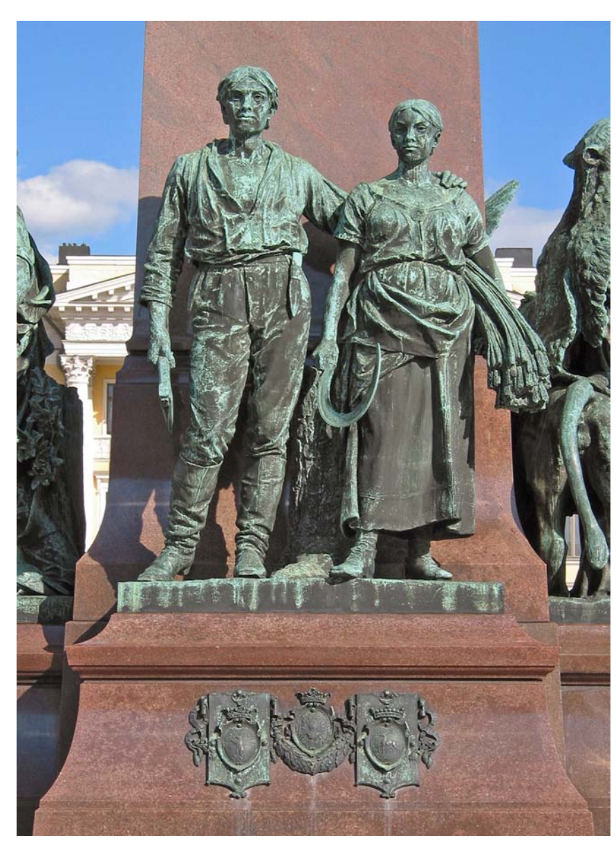
Fig. 5. Walter Runeberg (1839–1921), Labor, the western pedestal group of Czar Alexander II's monument in Helsinki. Inaugurated on 29 April 1894. Bronze, height 2,3 m. (Original plaster cast replaced in December 1894.)

In Finland, which before 1917 belonged to the Russian empire as a grand duchy, Czar and Grand Duke Alexander II (1818–1881) introduced the first steps towards liberal reform. In 1863 at the Finnish parliamentary assembly, or lantdag , he put forward a proposition which confirmed the autonomous status of the grand duchy and strengthened the position of the Finnish-speaking majority against the traditionally Swedish-speaking nobility and bourgeoisie. After the assassination of Alexander II, in 1881, Finnish authorities issued a call for the erection of his monument in the Senate Square in Helsinki. In the competition for the monument, the top-ranked proposals were by Johannes Takanen (1849–1885) and Walter Runeberg (1838–1920). In the end, it was decided that the two would share the commission. Takanen would execute the main statue of the czar, and Runeberg would develop the four pedestal groups outlined in his proposal. However, Takanen's premature death, in 1885, meant that Runeberg assumed responsibility for the whole project. Of interest for the present topic is only one of his four pedestal groups, placed at the west side of the present monument and dedicated to Labor, Labour (fig. 5).